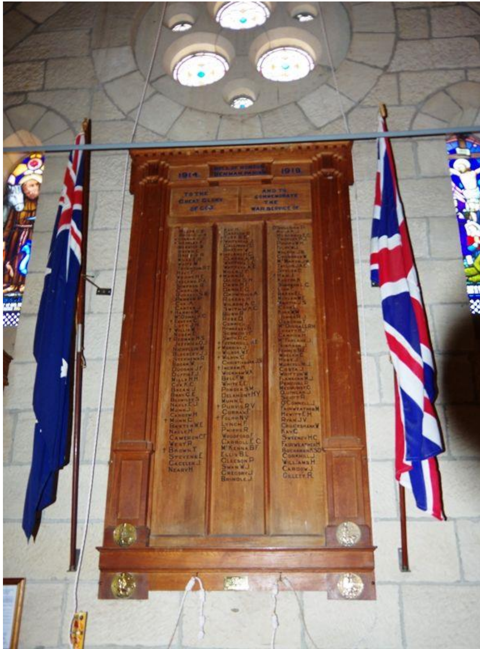
Denman Parish Roll of Honour